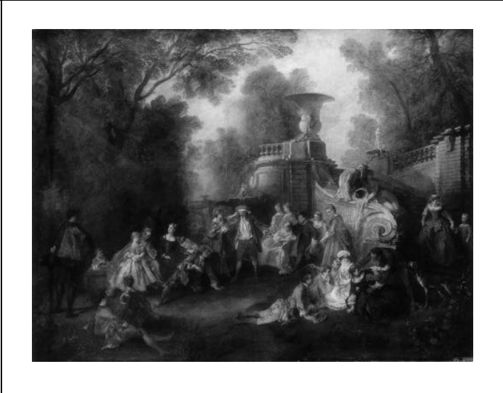
14. Nicolas Lancret, A Game of Blind Man's Bluff, oil on canvas, 97.3 x 129.1 cm. Potsdam, Stiftung Preussische Schlösser und Gärten, Schloss Sans-Souci.

These eight paintings share a unity of approach and execution. They reveal the general influence of French rococo painting, not so much from Watteau as from Pater, Lancret, and that generation of Watteau's so-called satellites. The Miles Master's awkward poses reflect the animated gestures frequently encountered in the works of Pater and Lancret, but whereas in a typical Pater such as The Dance in The Wallace Collection (fig. 13), the figures move gracefully and convincingly, comparable gestures in the Miles Master's works are exaggerated and awkward. The Miles Master's preference for tall, curving garden walls, often adorned with urns set on high, has much in common with Lancret's compositions, such as his Blind Man's Bluff in Potsdam (fig. 14). And Lancret's centrifugal depiction of that game seems to anticipate the formula attempted by the Miles Master (fig. 7). In short, the features seen in these fêtes galantes invalidate the possibility of the early 1715-16 date proposed by Ingamells and Raines for Roy Miles' painting. The Miles Master did not anticipate Watteau's mature works (an improbable assertion in the first place) but, instead, registered the impact of the second