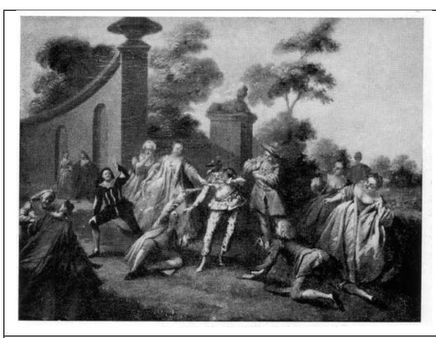
7. The Miles Master, A Game of Blind Man's Bluff, oil on canvas, 34 \times 43 cm. Whereabouts unknown.

Another painting assignable to our Notname is a fête galante that appeared at auction in Brussels in 1968 with an improbable attribution to Watteau himself (fig. 7).<sup>7</sup> Like the painting owned by Roy Miles, this composition features a central grouping of figures, a small wedge of additional figures in darker tones at the left to create a repoussoir, and an opening to the distance at the right that creates a sense of depth. Almost all of the characters lean to one side or the other to simulate movement but they seem hyperactive rather than graceful. The high garden wall curves out dramatically, like the one in the Miles painting, to create another flaring accent in this already busy composition.