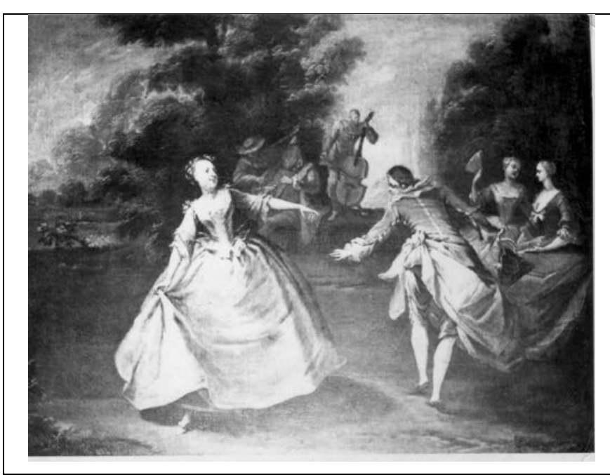
9. The Miles Master, Fête galante, oil on canvas, 40.6 \times 51.5 \text{ cm} . Whereabouts unknown.

Yet another painting wrongly attributed to Lancret but assignable to the Miles Master was on the New York market in the 1970s (fig. 9). The inclined stance of the female dancer seems par for the course, but the posture of her male partner is even more remarkable: his legs are not aligned with the angle of his torso. The bland face of the woman and the curiously warped faces of the two women at the right are recurring characteristics in the work of the Miles Master.