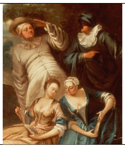
2. Detail of figure 1.

A key element in Roy Ingamells and Robert Raines' construction of Philippe Mercier's early career as a painter is a fête galante then in the collection of the celebrated London dealer Roy Miles (figs. 1-2).¹ It depicts elegantly dressed men and women dancing on the terrace of a garden, a trio of musicians at the left, and others at each side conversing. Completing the repertoire of characters, a man dressed as Pierrot appears at the right. This work was apparently unrecorded until it appeared at a London auction in 1973.² These men were undoubtedly attracted to the picture not only by its appearance but also by its signature: "Mercier Pinxit 17...." Although there now is good reason to doubt the signature's authenticity, at the time it evidently seemed convincing.