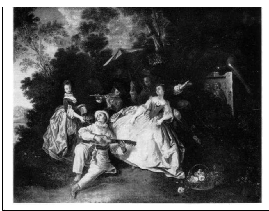
10. The Miles Master, Fête galante, oil on canvas, 65 x 81 cm. Whereabouts unknown.

A scene with music-making that came onto the French market in 1964 has all the by-now familiar syndromes (fig. 10).<sup>10</sup> The exaggerated, doll-like proportion of the characters, the awkward positions of limbs, and the dull, expressionless faces betray the Miles Master. Although the painting was attributed to Pater when it was offered at auction, it obviously has nothing to do with him.