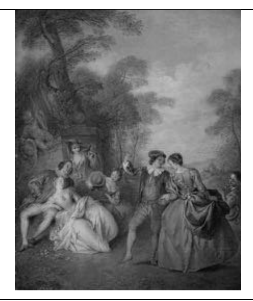
13. Jean Baptiste Pater, The Dance, oil on canvas, 56.7 x 45.7 cm. London, The Wallace Collection.