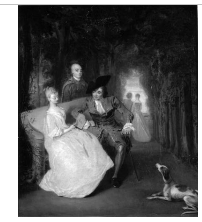
4. Philippe Mercier, Courting Couple, oil on canvas, 34.9 x 29.8 cm. Whereabouts unknown.

However, Roy Miles' picture bears no stylistic relationship to German painting in the early 1710s. In fact, it presupposes the creation of the fête galante in Paris after 1715/20 and, as will be seen, Miles' painting probably dates from the 1720s or perhaps even later, from the 1730s. Most damning of all, the style of the painting bears no resemblance to Mercier's earliest manner nor does it correspond to Mercier's slightly later works of the mid 1720s (fig. 4). The distinctive, perhaps even unpleasant figures in the Miles painting, the exaggerated, lunging movements of the men and women, and their curiously warped faces—all these elements set the picture apart from Mercier's known oeuvre.