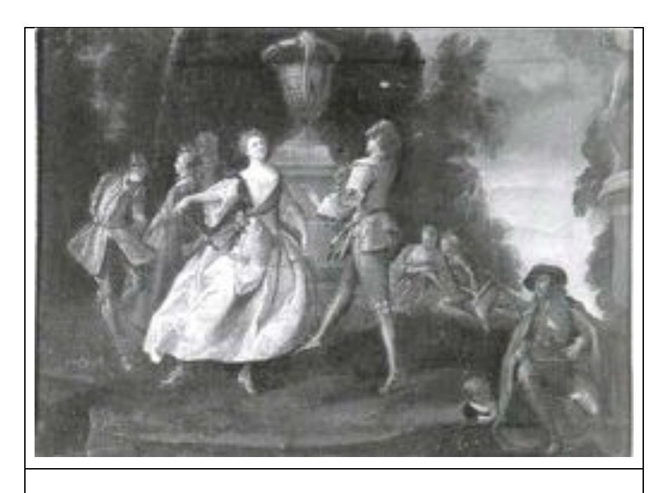
6. The Miles Master, Fête galante, oil on canvas, 56.5 \times 83 \text{ cm} . Mâcon, Musée des Ursulines.

A version of the previous picture was recently discovered in the Musée des Ursulines in Mâcon (fig. 6).<sup>6</sup> It repeats the central section of the previous composition, but not the figures at the left nor the children next to the hurdy-gurdy player. Also the statue at the right has been cropped away and the expanse of trees and sky at the top of the painting has been eliminated. One might almost think that the painting has been cut drastically, but the absence of the children next to the hurdy-gurdy player suggest that the Mâcon painting was intended as a reduced repetition.