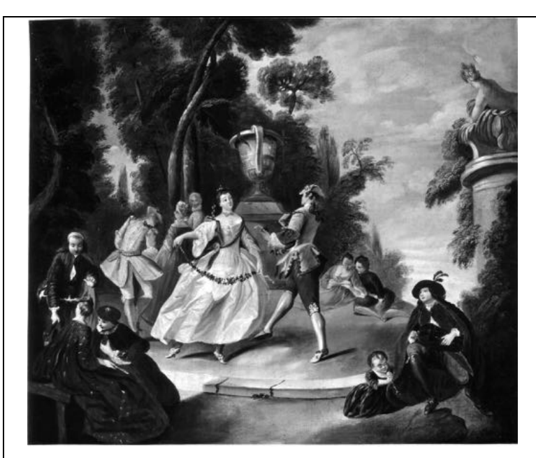
5. The Miles Master, Fête galante, oil on canvas, 79 x 95 cm. Whereabouts unknown.

specific artist. Yet, as will be seen, one man was responsible for all of them. To give appropriate coherence to this otherwise unidentified painter's oeuvre, I have chosen to name him, faute de mieux, "The Miles Master."