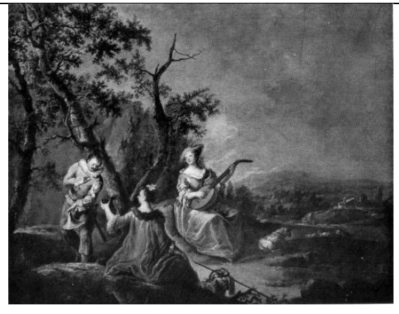
12. The Miles Master, Scene galante, oil on canvas, 40 \times 50 cm. Whereabouts unknown.

Our last two additions to the Miles Master's oeuvre were presented simply as anonymous eighteenth-century pictures when they came up for sale. One is a painting that twice was on the Vienna market, each time attributed simply to a French master of the eighteenth century (fig. 11). 11 Although the composition is quite similar to the preceding ones, the subject is slightly different in that a number of the characters are fancily costumed—as a Turk, a Punchinello, and men as knights or martial gods in suits of armor. But if the subject is slightly unusual, the people's faces and lurching, inclined poses are unmistakable. The last picture, a composition with just three primary figures was on the Brussels market where it was presented as an anonymous work of the eighteenth century (fig. 12). 12 It too should be given to the Miles Master.